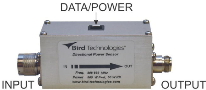
Figure 1 Bird 4045 Series Power Sensor

The 4045 Series power sensors are typically used to measure forward and reflected average power on a 50 ohm RF transmission line with a maximum 500 watt forward and maximum 50 watt reflected power levels in a frequency band with an overall range of 144 to 960 MHz. See " Model Identification " on page 6 for specific frequency ranges and model features. The 4045 sensor also provides a VSWR reading.