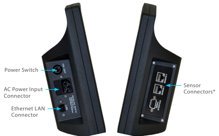
MODEL 4421A Side Views

The 4421A is the next generation replacement for the industry standard Model 4421. Building upon the original model's high level of accuracy and its ease of use, the new 4421A enhances the meter's functionality by utilizing a smaller/lighter design, and by providing the ability to have dual sensor inputs.