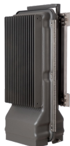
DMR800 & DHR800