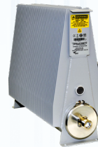
HIGH POWER LOADS