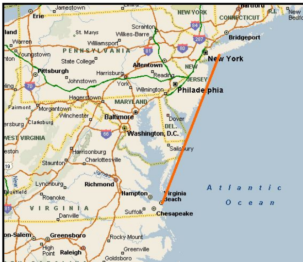
Figure 1: Path of duct from Virginia Beach to Long Island, NY

One of the more common forms of ducting is something known as an “evaporation duct.” This occurs over water and can cause a significant enhancement in propagation between land-based systems that have a large body of water between them. One example on the East Coast of the United States would be the path between Virginia Beach and Long Island, NY ( Figure 1 ). The duct forms when the air immediately above the water is saturated with water vapor, while at the same time the barometric pressure is relatively unchanged and the air temperature is either unchanged or increasing (temperature inversion). This causes the radio signals to bend back toward the surface of the ocean.